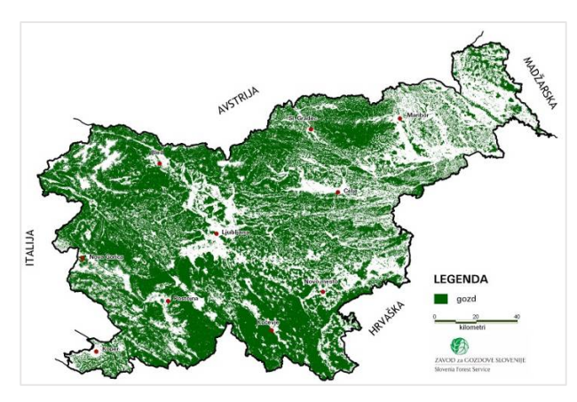
Forest cover in Slovenia

Slovenia is situated in southern Central Europe between the Adriatic coast, Alps and Pannonian lowlands. It covers 20,273 km² and has a population of 2.06 million inhabitants. The territory is mostly mountainous with a mixture of continental, Mediterranean and Alpine climate. This reflects in a significant biological diversity and wide variety of habitats which also influence forests.