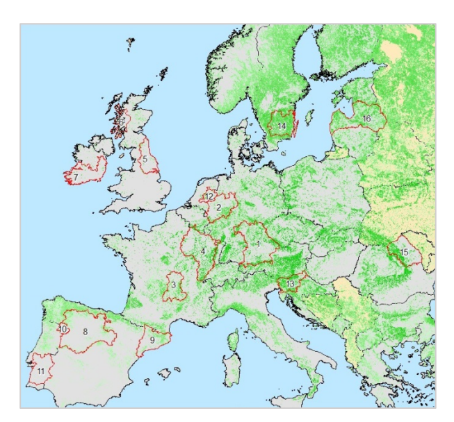
1. Bavaria, GER 2. North-Rhine Westphalia, GER 3. Auvergne, FRA 4. Grand-Est, FRA 5. Yorkshire & North East England, UK 6. Lochaber, UK 7. South Eastern Ireland, IRE 8. Castile and León, ESP 9. Catalonia, ESP 10. Nordeste, PRT 11. Alentejo, PRT 12. Overijssel & Gelderland, NLD, 13. Slovenia, SVN 14. Småland, SWE 15. North-East Romania, RO 16. Latvia, LV

In each region, we have a Regional Learning Laboratory (RLL) as an integral part of the research process. This is linked to existing initiatives in the region, and is collaborative: teaming up with regional stakeholders to obtain