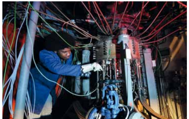
Test facility of annular combustion chamber