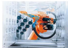
Production, Automation, Logistics