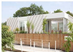
Energy-efficient Buildings & Technologies