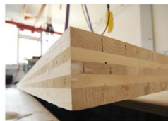
New Materials & Components