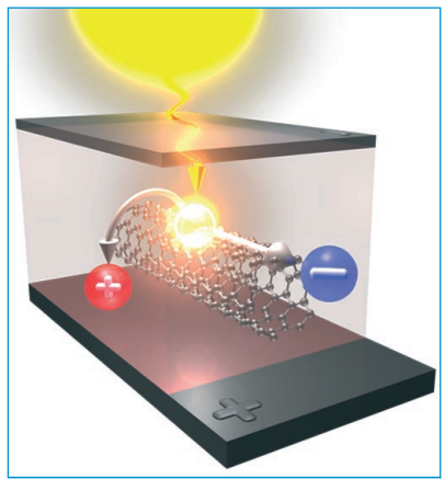
Sunlight is absorbed by the carbon nanotubes and utilized to generate electricity. ■

That is not the only reason why nanotechnology is regarded by the EU as one of the important key technologies of the 21<sup>st</sup> century. Market estimates suggest that the share of nanoproducts on the world market will amount to about EUR 700 billion by 2015. By 2020, the total revenue of products incorporating nanotechnology as the key component should even reach two trillion euros. In other words, these "tiny" particles will generate about six million jobs.¹ ■