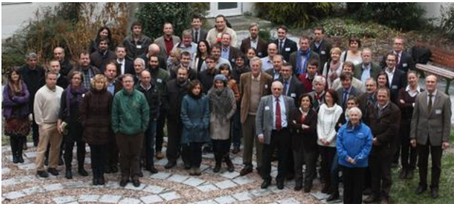
SIMWOOD partners at the project kick-off meeting in Freising, Germany.

In November 2013, 28 organisations from 11 countries (Belgium, Finland, France, Germany, Ireland, Netherlands, Portugal, Slovenia, Spain, Sweden and United Kingdom) began the European collaboration FP7 project SIMWOOD (Sustainable Innovative Mobilisation of Wood) . This four-year project seeks to provide solutions on how to mobilise forest owners, promote collaborative forest management and ensure sustainable forest functions in order to mobilise the present unlocked wood resources in Europe.