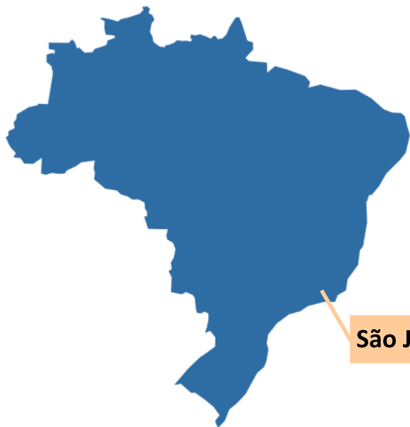
São José dos Campos

Following the 9 th RLS in Québec in 2018, the 2019 RLS-Sciences Conference was hosted at the invitation of the São Paulo Research Foundation (FAPESP) at the National Space Institute - Integration and Testing Laboratory (LIT). The five day conference was a bridge conference for RLS-Sciences between the biennial political Regional Leaders Summits.